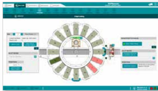
Chip Coding Stations

MB MCES is able to supports different interface methods. The data acquisition handles the input files with a variety of different formats ranging from classic formats like Tag Length Value (TLV) coded files, through Comma Separated Lists (CSV) flat files, to Extensible Markup Language (XML) files. The data required for the personalization process is merged with the product information within MB MCES. All personalization data can be buffered in encrypted form. They are deleted after use. The backend of the MCES are