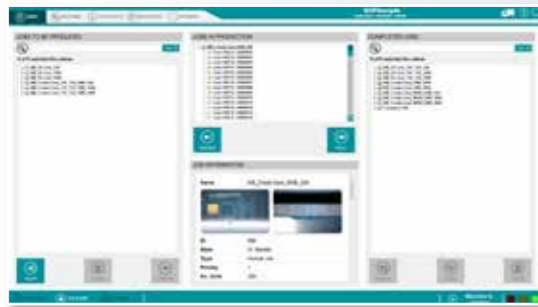
To do, In Progress & Finished Queues